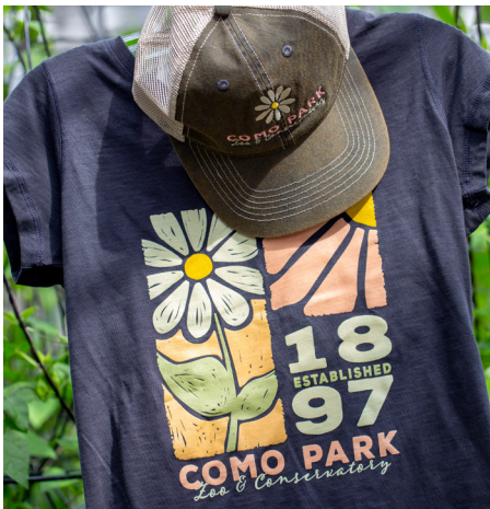
Como Friends Gift Shop | 12