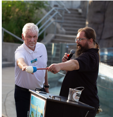
Sparky's Biggest Fan | 6