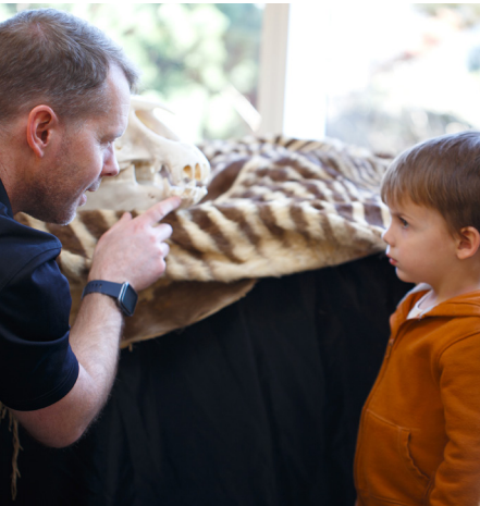
Members Get More! | 4