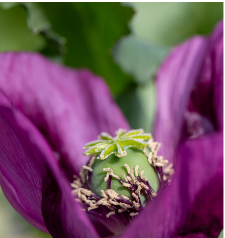
The Magic of Como | 8